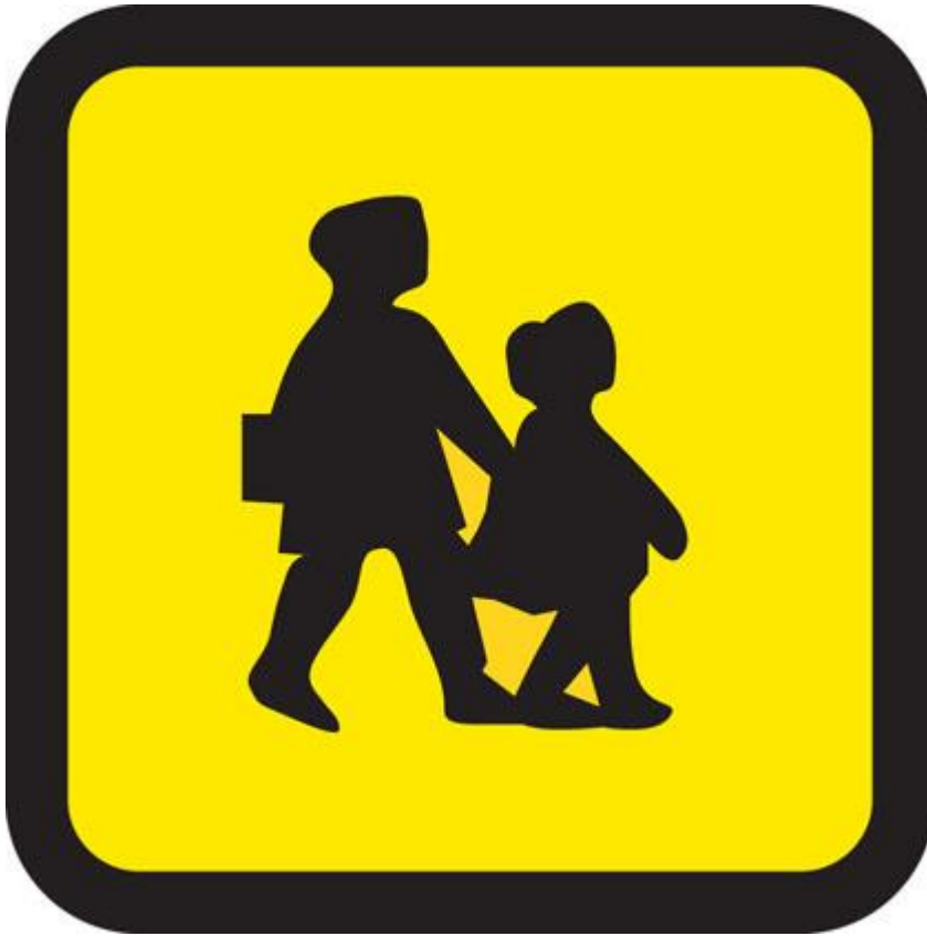
School bus (displayed in front or rear window of bus or coach)